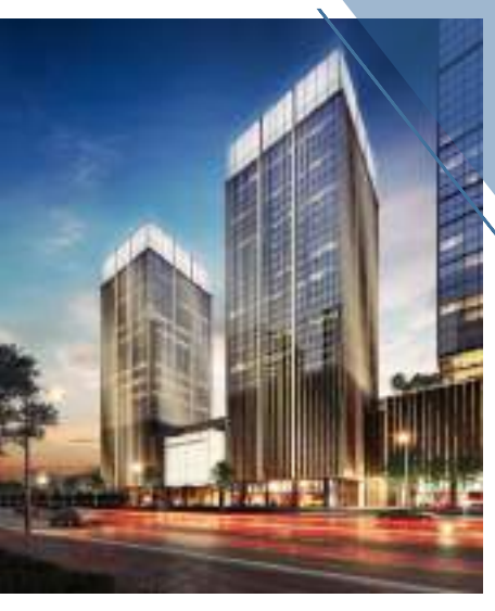
PAVILION EMBASSY @KLCC