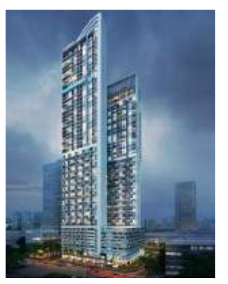
THE LUXE & COLONY@KLCC