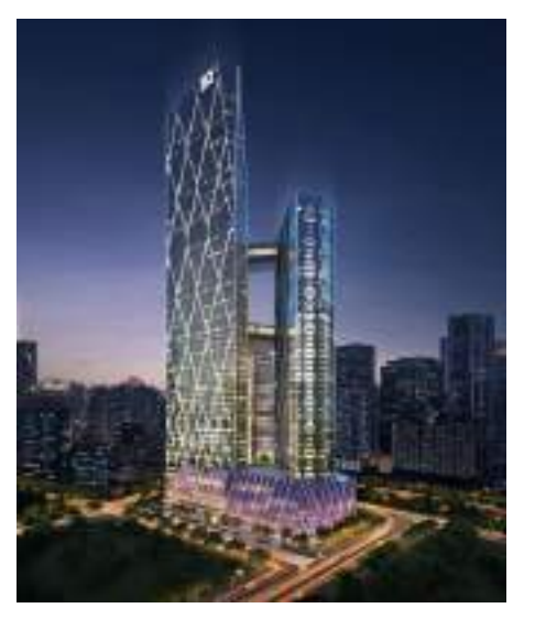
OXLEY TOWERS @KLCC